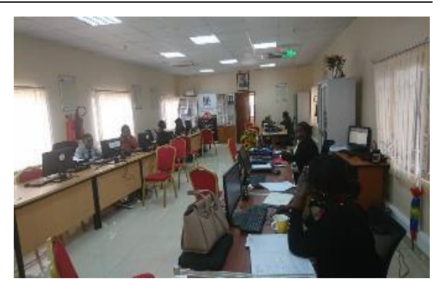
The One-stop Centre at the Ministry of Public Service in Kampala