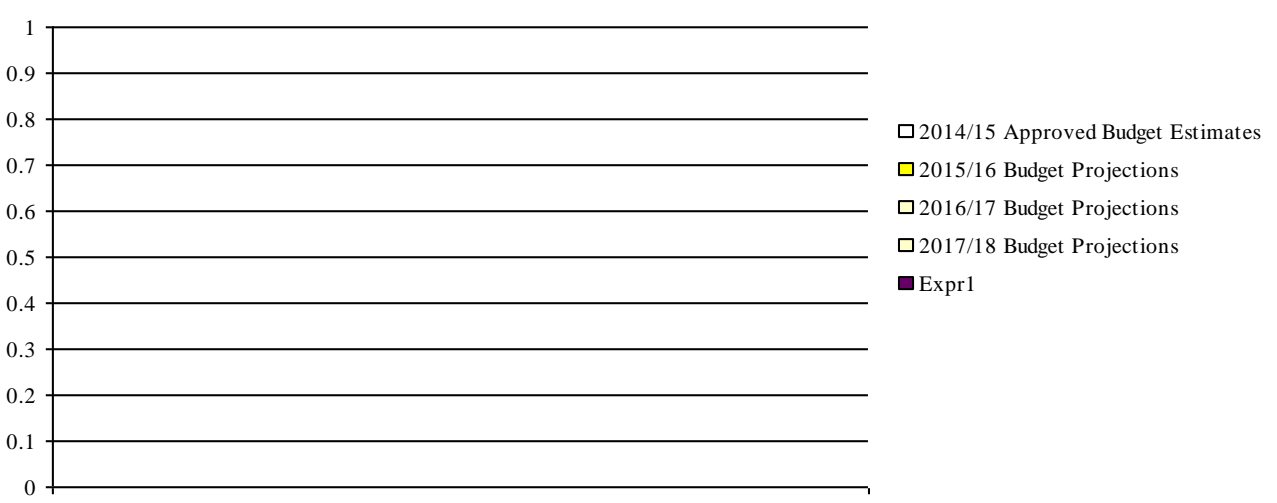
Urban Planning, Security and Land Use

The chart below shows total funding allocations to the Vote by Vote Function over the medium term: Chart V1.1: Medium Term Budget Projections by Vote Function (UShs Bn, Excluding Taxes, Arrears